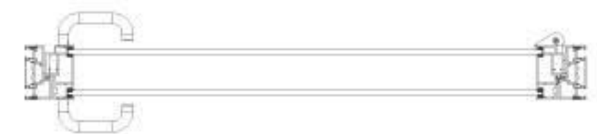
IN WALL STILE DOOR